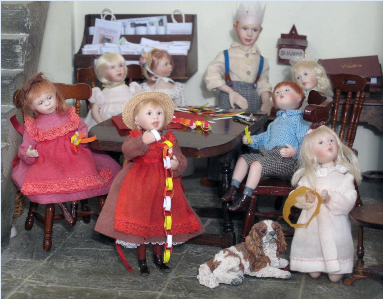
The children are making yellow, red, orange and white paper chains to decorate the church for the celebration of the birthday of the church at Pentecost.